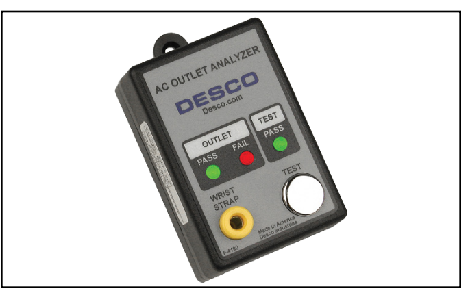
Figure 1. Desco 98132 AC Outlet Analyzer and Wrist Strap Tester