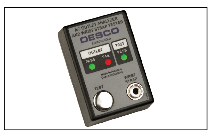
Figure 2. Desco 98131 AC Outlet Analyzer and Wrist Strap Tester